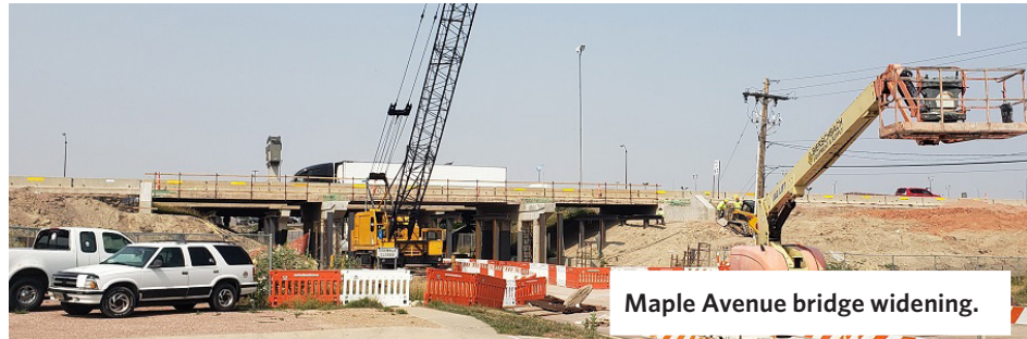
Maple Avenue bridge widening.