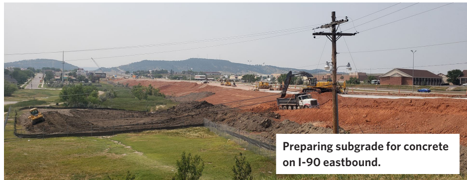
Preparing subgrade for concrete on I-90 eastbound.