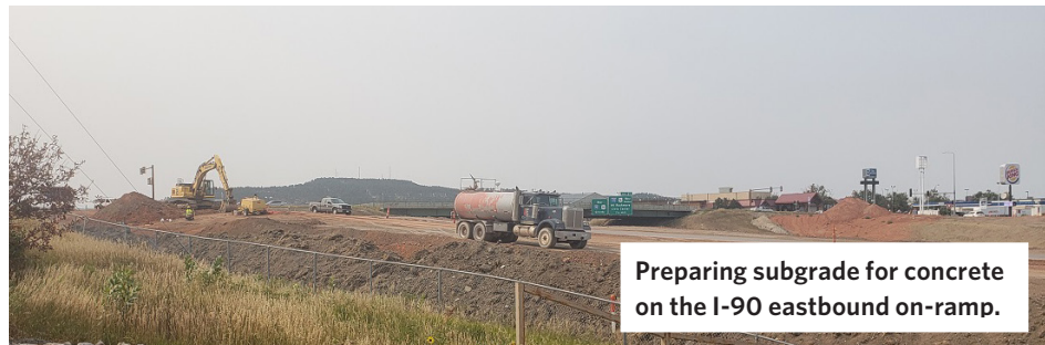
Preparing subgrade for concrete on the I-90 eastbound on-ramp.